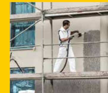
Plastering on the facade.