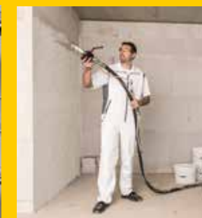
Plaster application in the interior.